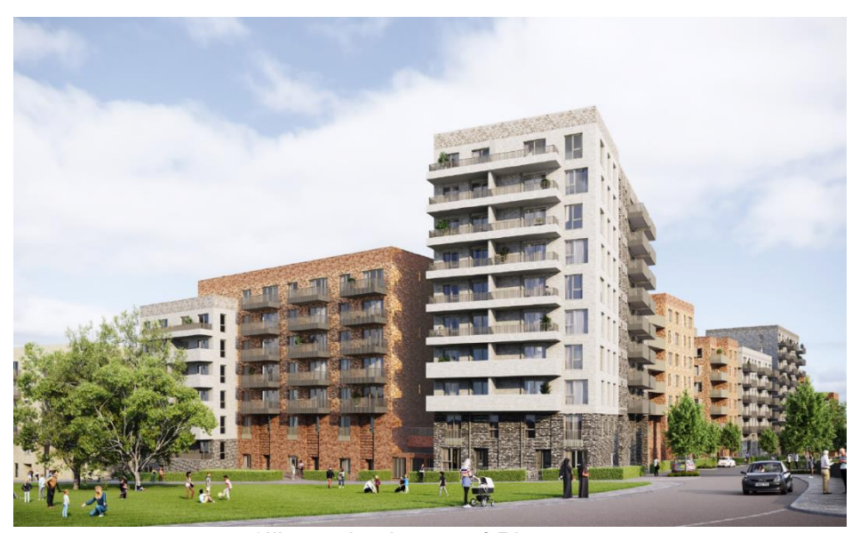
*Illustrative image of Phase 8.1

The demolition works will follow a different methodology to Jerome Tower due to the difference in height. Scaffolding will be erected around the building, Monarflex sheeting will encase several sides of the building, and the building will be demolished using a machine located at ground level.